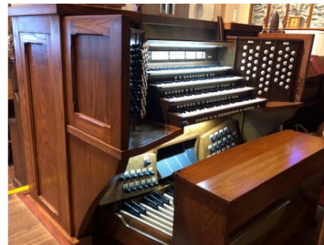
St. Cross Episcopal Church Hermosa Beach, CA New 4-Manual Draw-Knob Console