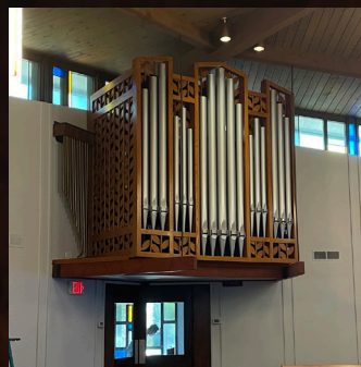
Mt Olive Lutheran Church Rancho Palos Verdes