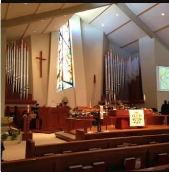
First Lutheran Church Torrance Reuter/Allen Hybrid

Please RSVP for lunch on the festival website by Thursday, February 15.