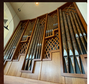
St. John Fisher Catholic Church Rancho Palos Verdes