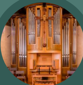
Glatter-Götz/Rosales Pipe Organ

Los Angeles Chapter members - take advantage of your online account on our website, www.laago.org , to gain access to the jobs listings and online directory.