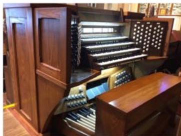
St. Cross Episcopal Church Hermosa Beach, CA New 4-Manual Draw-Knob Console